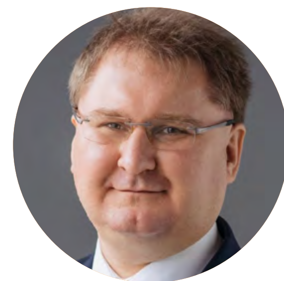
Taras Kachka, Deputy Minister of Economy – Trade Representative of Ukraine