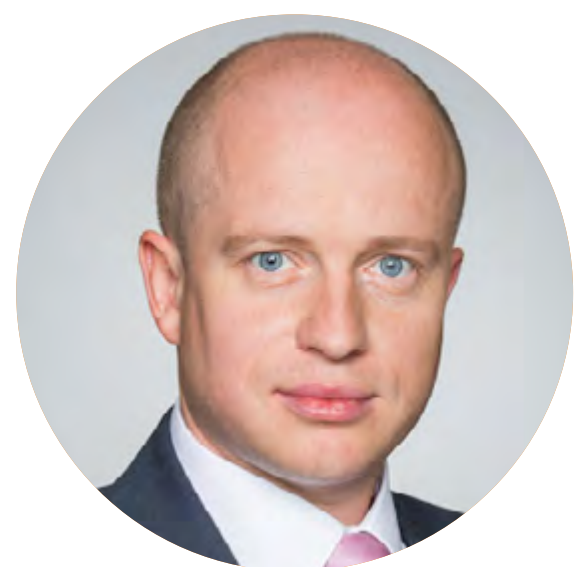
Yuriy Vaskov, Deputy Minister for Communities, Territories and Infrastructure Development of Ukraine