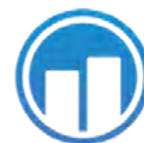
SDcapital Shuttle Diplomacy