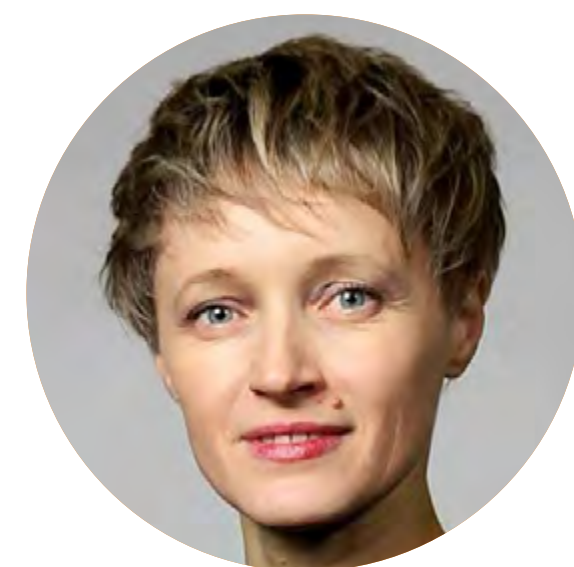
Olha Trofimtseva, expert in agriculture, ex-ambassador at large of the Ministry of Foreign Affairs of Ukraine