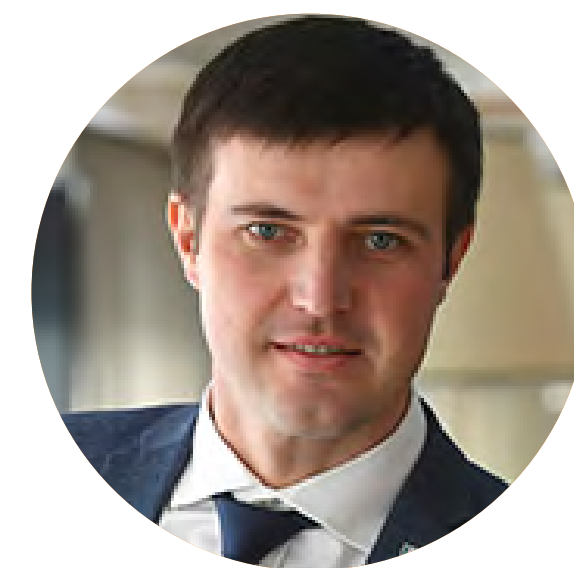
Taras Vysotskyi, First Deputy Minister of Agrarian Policy and Food of Ukraine